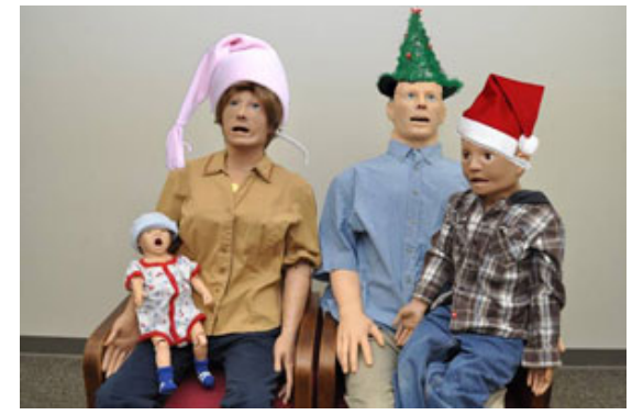
HealthONE EMS Manikins (left to right) Baby Hal, Suzie, Hal, and Justin Case

simpler and more sedate environment. I think that they found too many open beer cans and Big Hal had been sneaking into the bar late at night. Regardless, we moved from the north side of the building to the shi shi A/V closet. You'd think with all of that A/V gear that the tech guy could have left us a stereo. Nada. However, we do like our new digs. The accommodations are cozy, even though we are on top of one another.